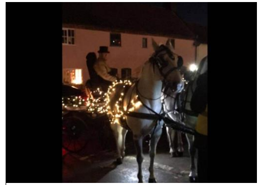
Father Christmas comes to Shottisham in style