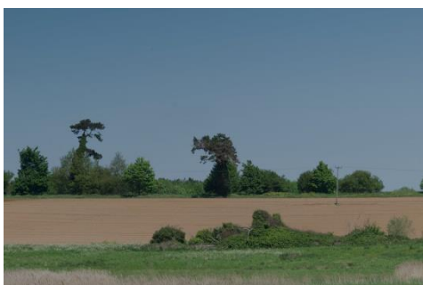
'Ramsholt dragon'