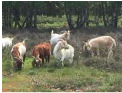
goats on the heath