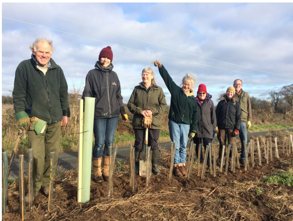
Pic: Waldringfield Scattered Orchard Group

Here in Waldringfield back in January of 2020 we began a project to restore field hedges where they were either non-existent or full of gaps. At rather short notice we were able to secure a grant from Suffolk Coast and Heaths, which we used to buy hedging plants, canes and guards from Sandy Lane Nursery near Diss.